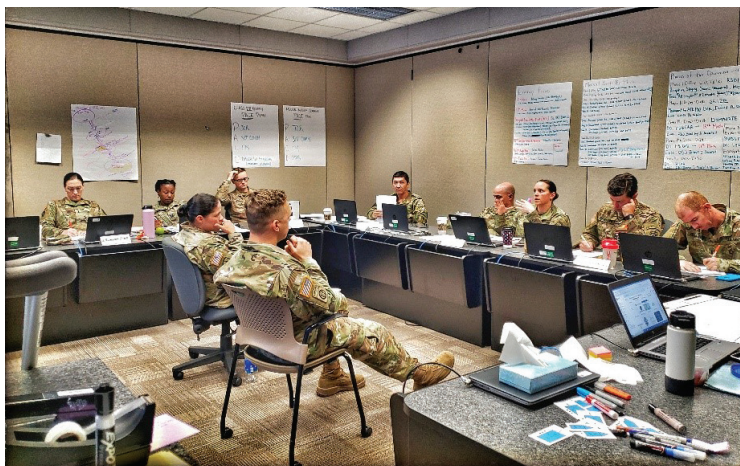
Figure 56-2. The Captains Career Course students discuss their medical concept of support plan with small group leaders (middle) during the military decision making process exercise in January 2020 at Joint Base San Antonio-Fort Sam Houston, TX.

All SGLs mentor AMEDD CCC officers assigned to their class regarding course performance, professional development, and their individual careers. The PASGL, as the senior representative for PAs in the MEDCoE CCC, provides specific guidance and career advice for all PAs in the course. The PA SGL is also responsible for providing mentorship opportunities for PA branch and program managers, as well as coordinating social events for the PAs.