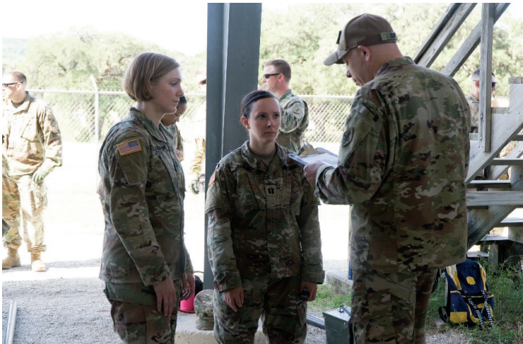
Figure 56-1. The small group leader (right) provides instruction to students during the leader reaction course in January 2020 at Joint Base San Antonio-Camp Bullis, TX.

The MEDCoE, at Joint Base San Antonio (JBSA), Texas, hosts the course. Both AMEDD officers and international military students attend the 9-week resident course. The SGL-to-student ratio ideally ranges from 1:12 to 1:16. 4 SGLs are responsible for facilitating learning through counseling, coaching, and team building (Figure 56-1). Students hone their critical thinking skills and challenge each other to succeed, through shared knowledge and lessons learned. Measures of effectiveness include graded written and oral communication skills evaluations, demonstrated knowledge of the military planning process, demonstrated knowledge of medical business processes, 5 and improved leadership skills as demonstrated by peer evaluations. 5